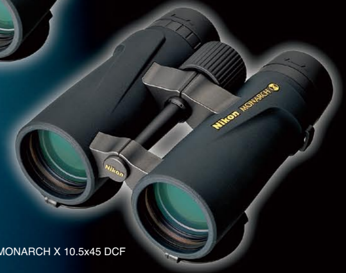
MONARCH X 10.5x45 DCF