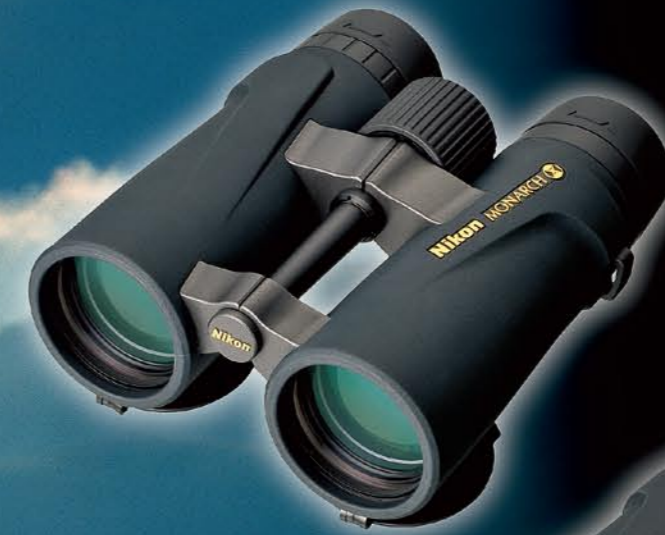
MONARCH X 8.5x45 DCF